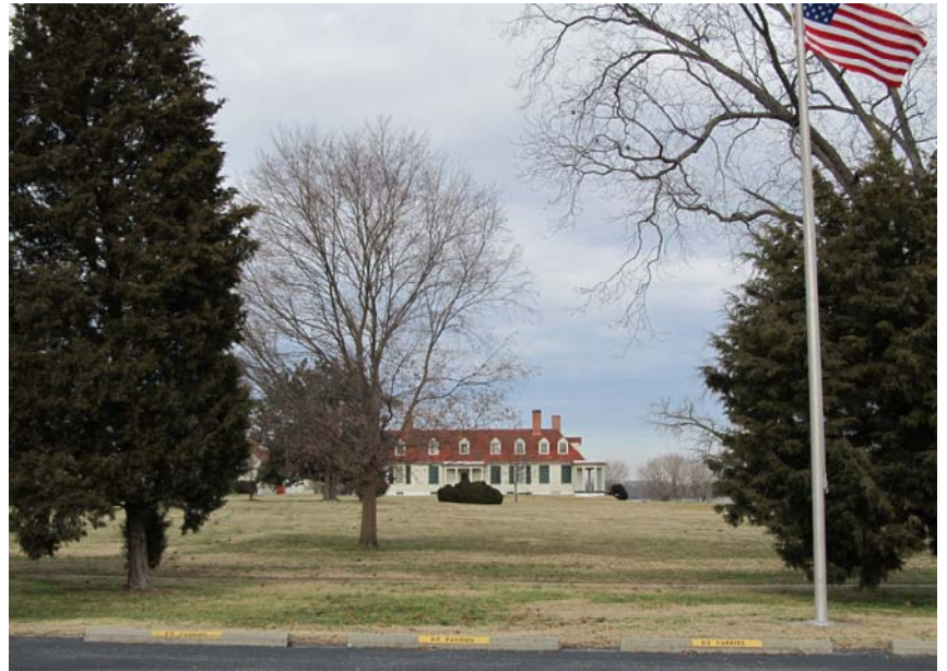
Appomattox Plantation. site of General Grant's headquarters cabin at City Point, Hopewell, Virginia