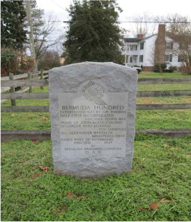
BERMUDA HUNDRED marker, placed by the Bermuda Hundred D. A. R.