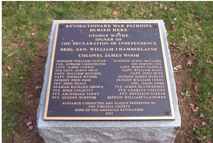
Historic marker at St. John's Episcopal Church, on Church Hill, in Richmond, Virginia.