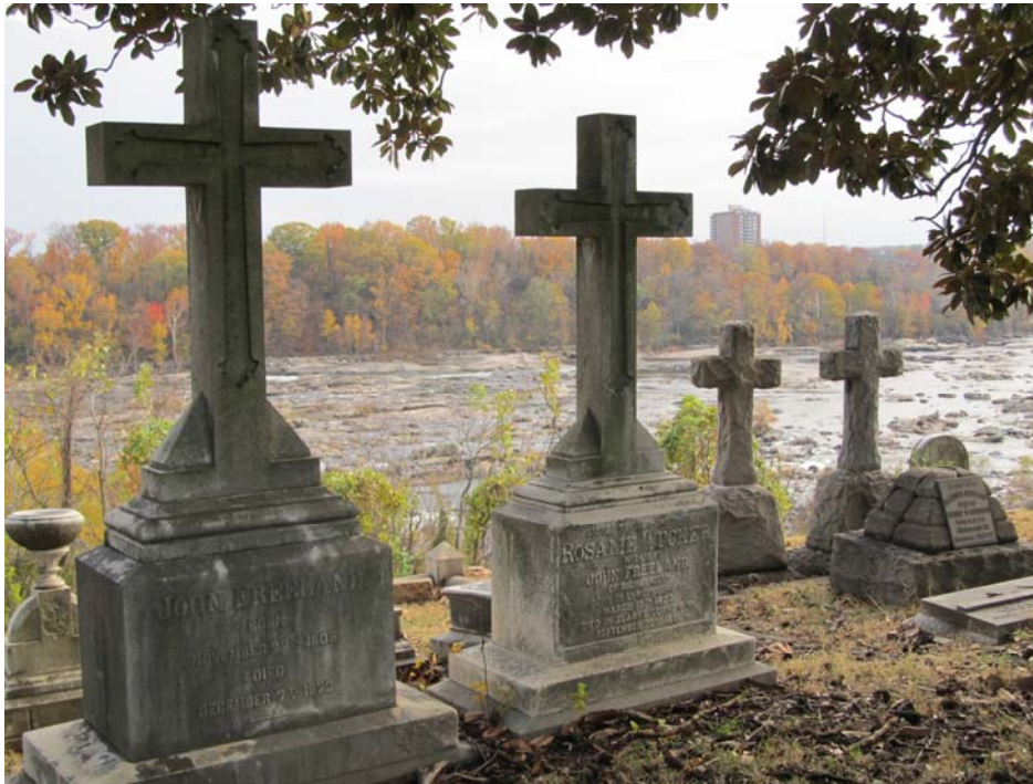
Some grave markers at HOLLYWOOD CEMETERY, Richmond Virginia, beside the James River

Our stops in “Old Richmond” will include: Soldiers & Sailors Monument on Libby Hill, the Medical Museum at Chimborazo Park, St. John’s cemetery on Church Hill, the American Civil War Center at Tredegar Iron Works, and Hollywood Cemetery.